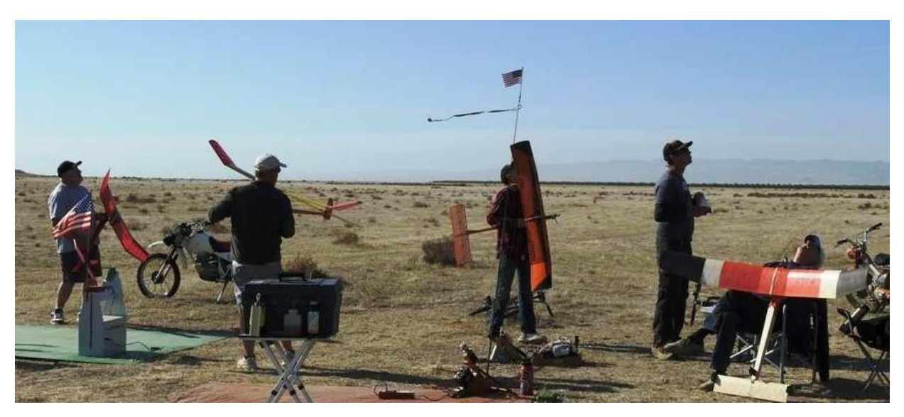
THE FLIGHT LINE - 2021 - Lost Hills CA